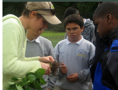
Hands-on examination and learning.