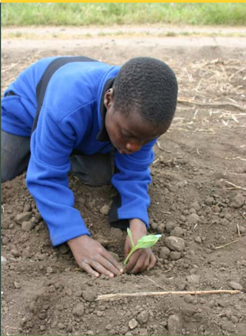
Connecting to the earth.