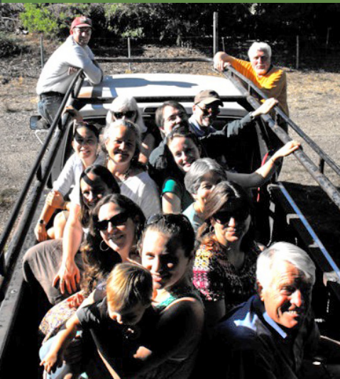
San Mateo County Food System Alliance.