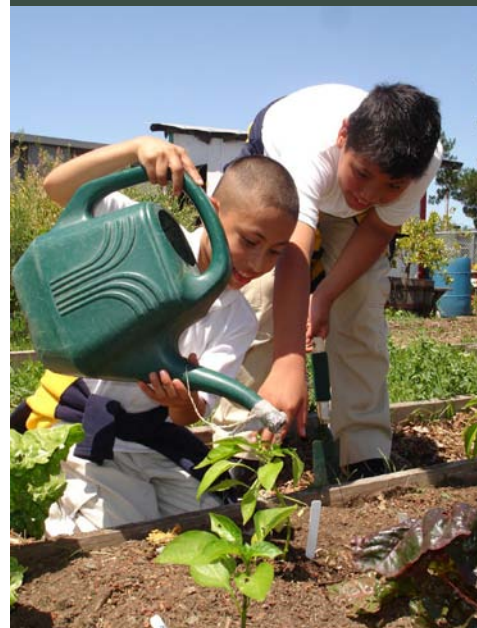
Learning and mentorship.