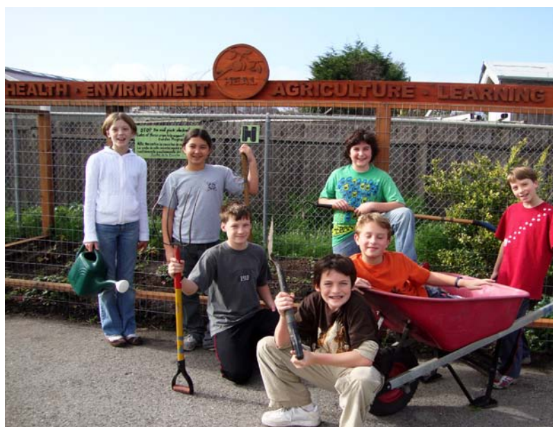
Teamwork and physical activity.