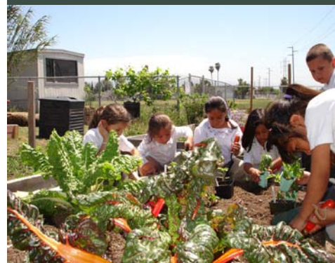
Working with rainbow chard.