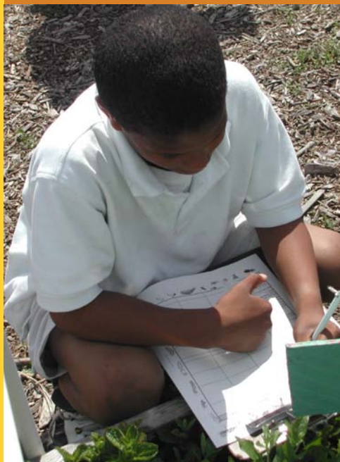
Observing, recording, analyzing.

For more information, contact garden@aginnovations.org . Additional school garden resources are available at http://www.getthehealthysmc.org .